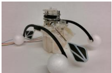
UWE developers hail the robot that feeds itself