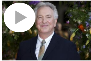
Alan Rickman dead: Harry Potter actor dies aged 69