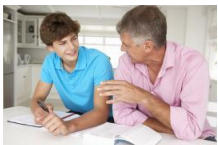
How to help your children apply for university