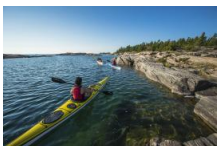
Settin' off from the dock of the Bay: Kayaking in Georgian Bay