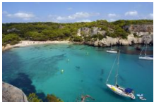
Spain by boat