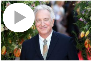
13 of Alan Rickman's best moments in film